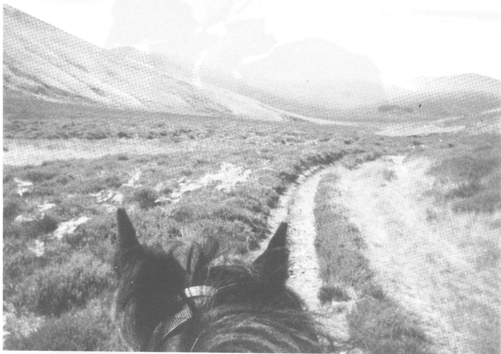
A view through Royal's ears, looking towards Skiddaw House.